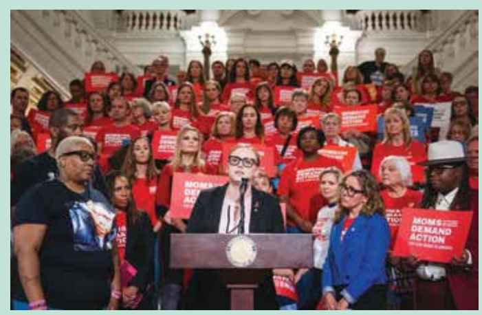
In October, I joined Moms Demand Action to call on the Senate to move forward the gun safety bills we sent, including my ERPO bill.