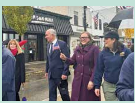
A little bit of rain couldn't put a damper on Media's Veterans Day festivities. Special thanks to Senator Bob Casey for joining the celebration.