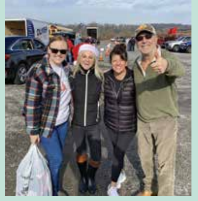
The donations were flowing at the Delaware County Veterans Memorial Association this past holiday season thanks to the generosity of so many!