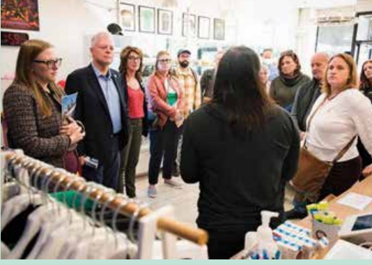
Last fall, I hosted legislators, local officials, and stakeholders in Media for a policy tour and round table on pedestrian safety and the importance of Main Streets.