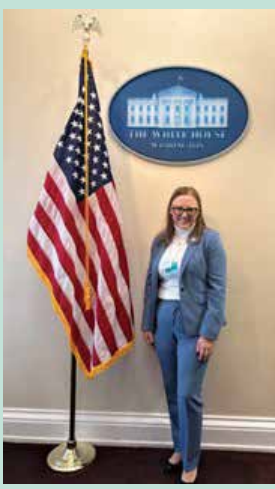
In December, I attended the largest convening of state legislators so far to discuss various gun-violence prevention tactics, such as ERPO or Red Flag laws.